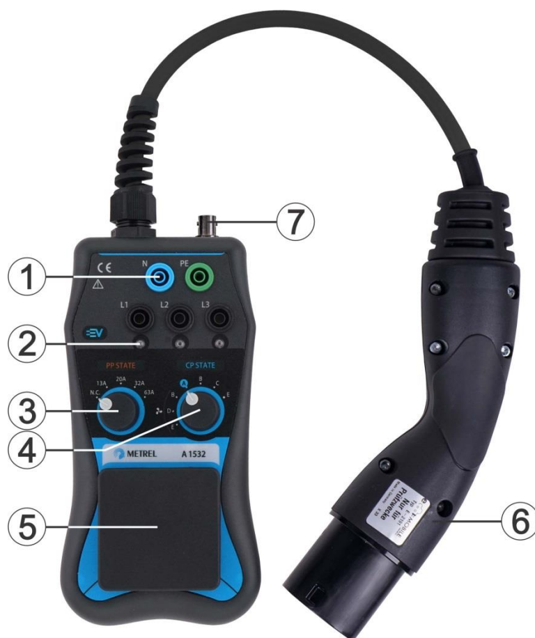
Figure 3.1: A 1532 components